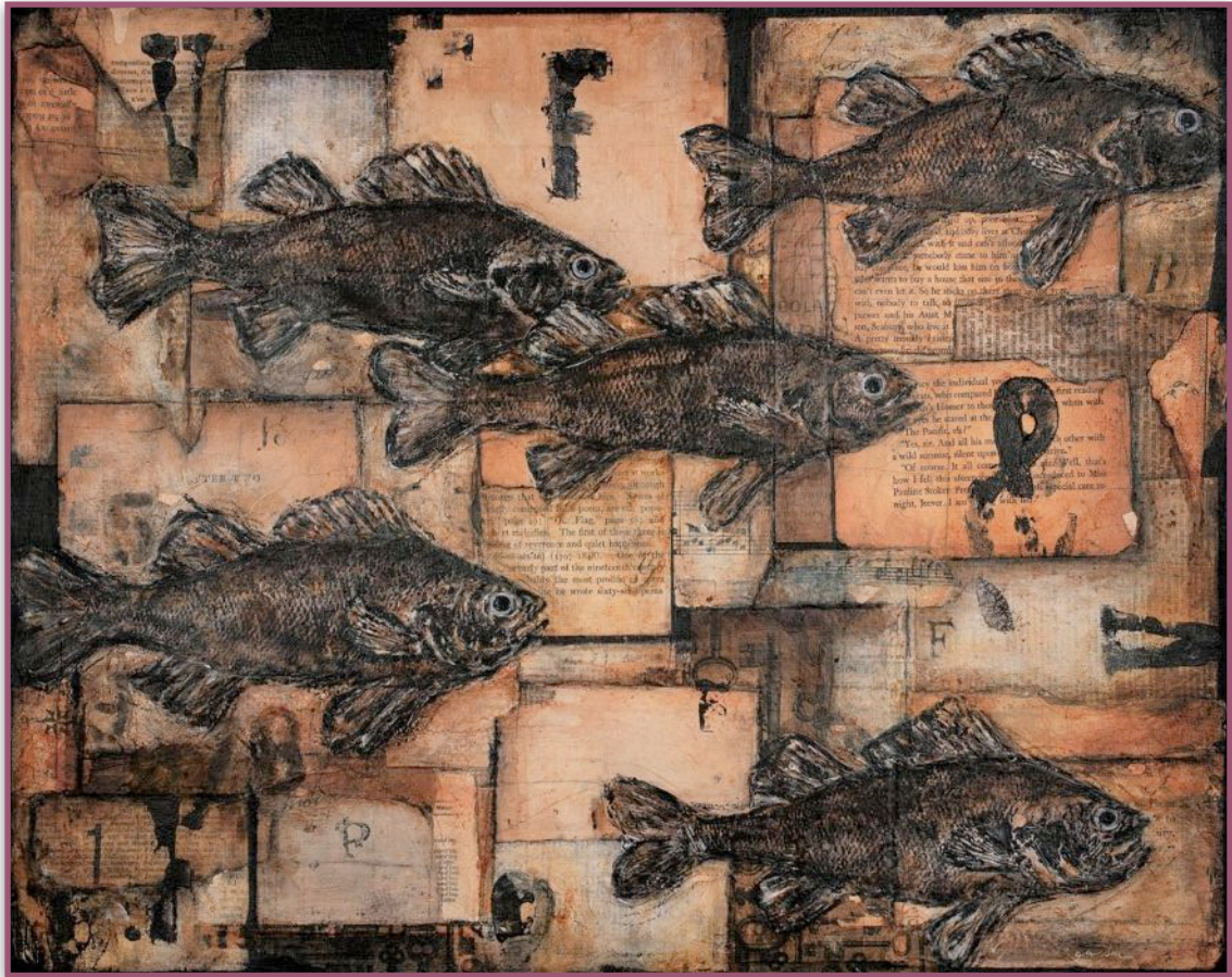
A School of Gifted Fish