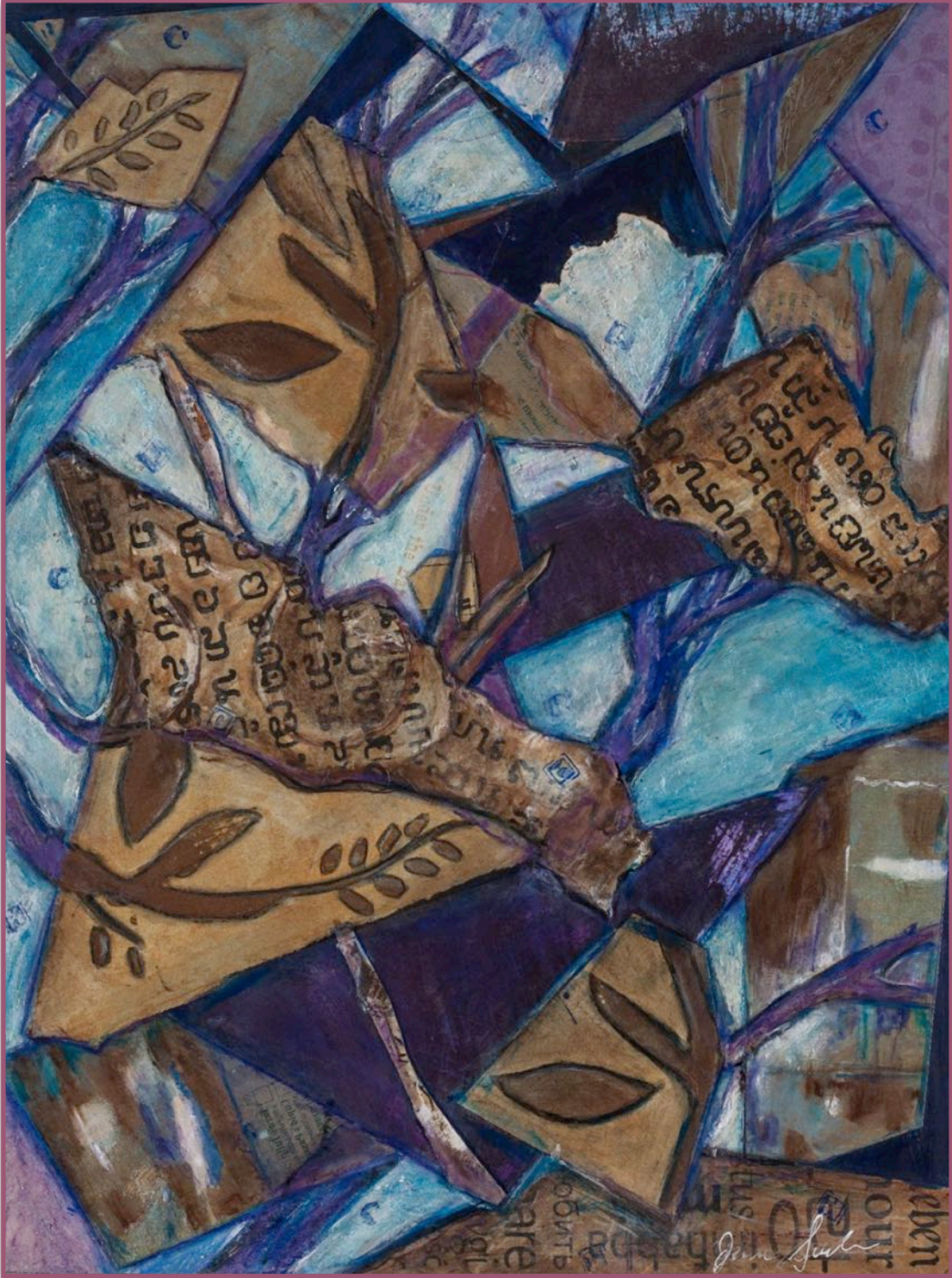
The Secret Language of Trees