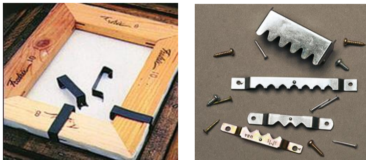
Clip style frame mounts and strip hangers are not acceptable