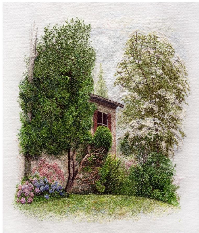
The House Next Door - Ekaterina Sinchinova