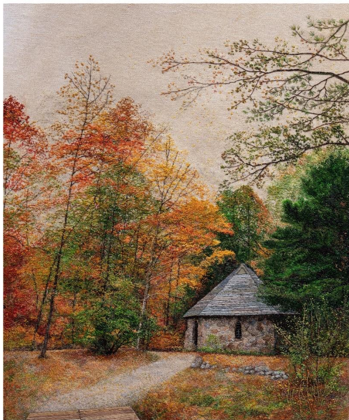
Columille Megalith Park – Ekaterina Sinchinova

My pictures have been published in such online publications and magazines as Colossal, 365ART+, What Women Create, Netolabo, and others.